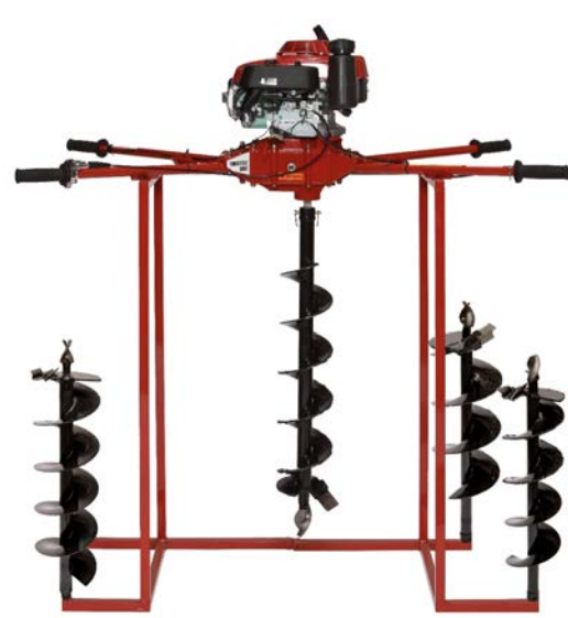
Stand and auger bits sold separately