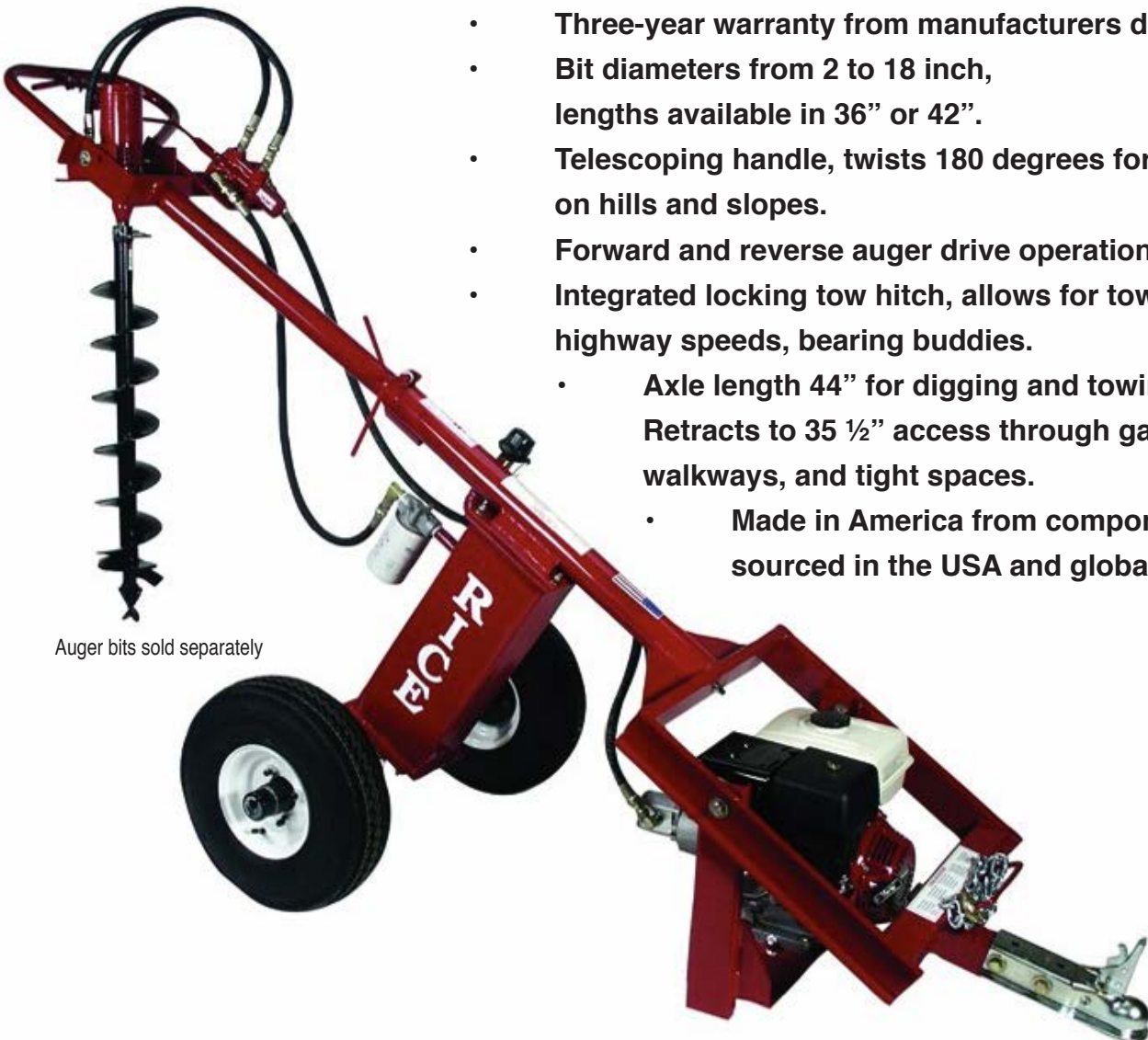
Auger bits sold separately