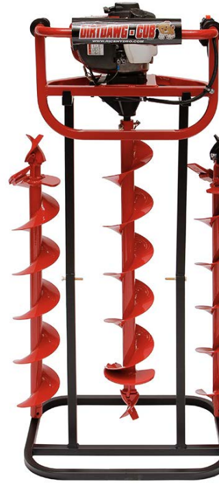
Additional Bits and stand sold separately